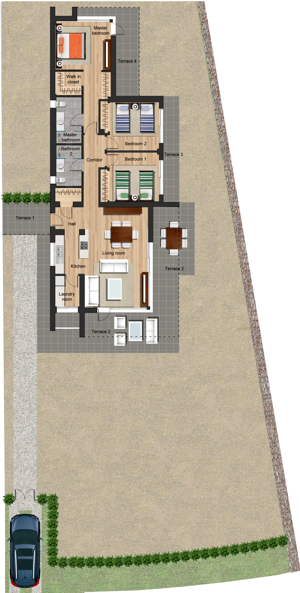
FLOOR PLAN SCALE 1:150